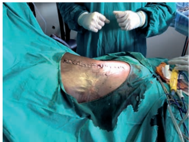
Figure 4. Abdominal wall closed after the second-look operation.