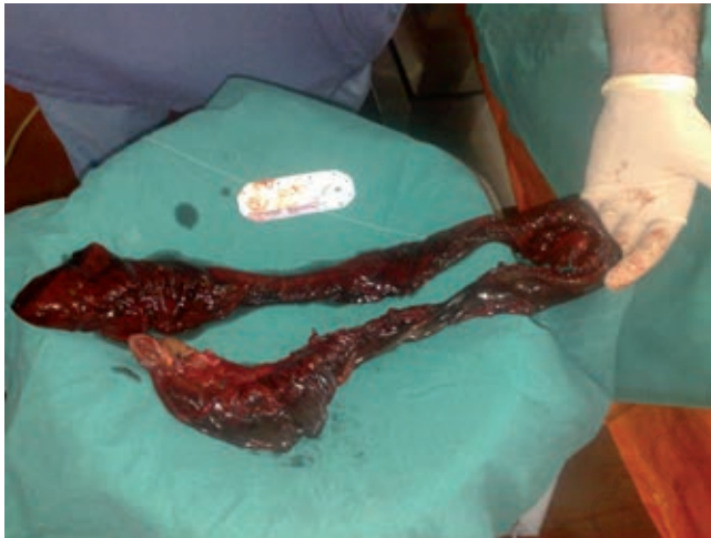
Figure 1. Resected necrotic gut.

pital supplied with more resources), the author might have opted for another operation and would have probably performed a primary anastomosis draining the intestinal obstruction during the same procedure, but in a rural hospital everything should be done to minimize the post op complications. The woman was sent in surgical ward for resuscitation and stabilisation, as the ICU is unavailable. In the I POD the discharge of intestinal content was about 400 mls and the following day, before taking again the patient to the theatre, about 700 mls. After 48 hours the patient was brought back to the theatre for the second look operation. We found a very detended intestine and no signs of peritonitis. After removal of the Foley catheter we proceeded to perform an ileo-ileal side-to-end anastomosis with an interrupted Vicryl 3/0 single layer suture. The gut appeared vial, vital and patent. Finally we closed the muscular sheath using a Nylon n. 2-interrupted suture without need of detensive incisions on the pararectal fascial edges (Figure 4). Skin was sutured using Nylon 2 interrupted stitches. The PO period was uneventful and without any complication, the patient was dis-