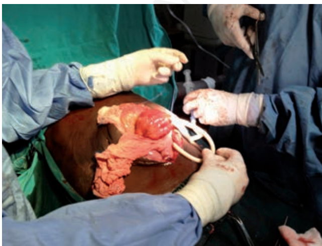
Figure 2. Derivating the intestinal content using a big Foley catheter.